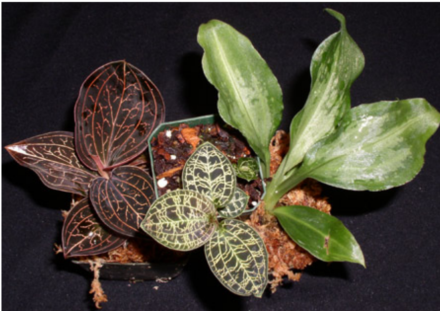
A selection of Jewel Orchids from Oak Hill Gardens.

Originally published in The Orchid Review, Vol.1023 No. 1197, May/June 1994 and taken from the December 2011 issue of the newsletter of the CVIOS.