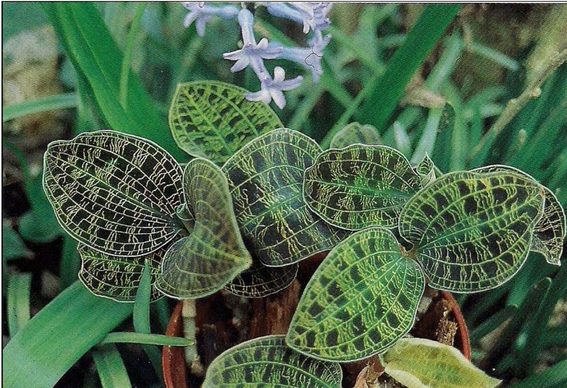
Macodes petola