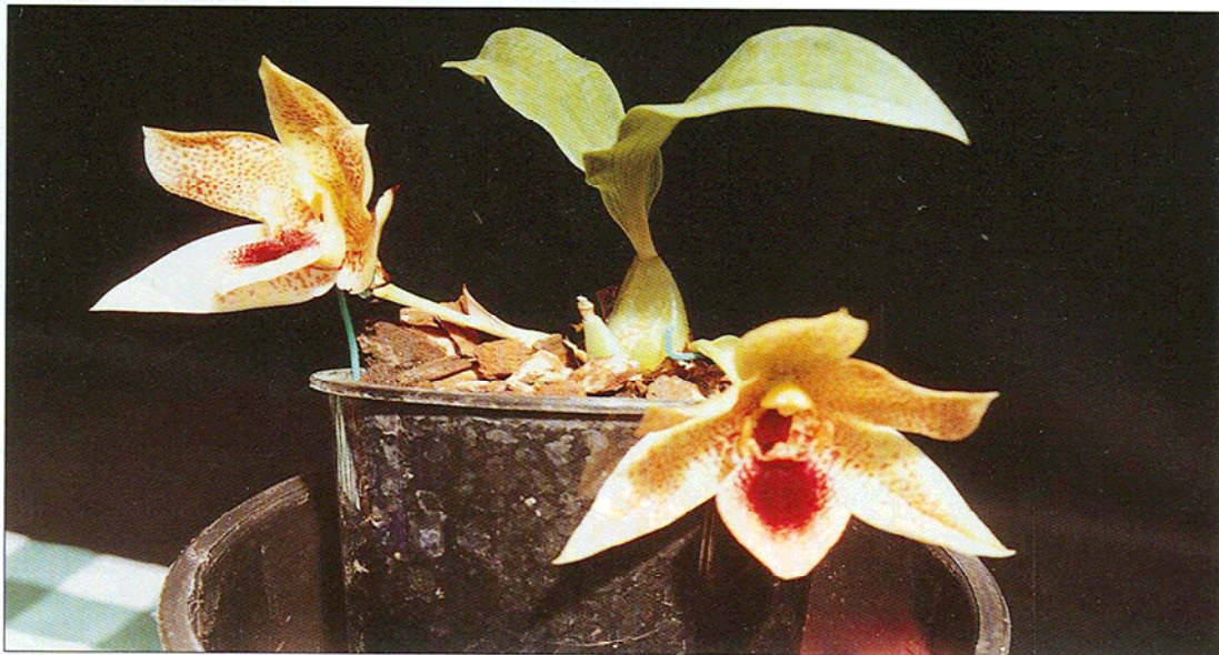
Prom. (Samsu x stapelioides) showing two flowers on a two bulb plant.

The shells hold moisture when we water and the weed matting is very easy to keep clean. In fact, we often sweep it off with a small hearth broom to remove any dislodged bark or dead leaves.