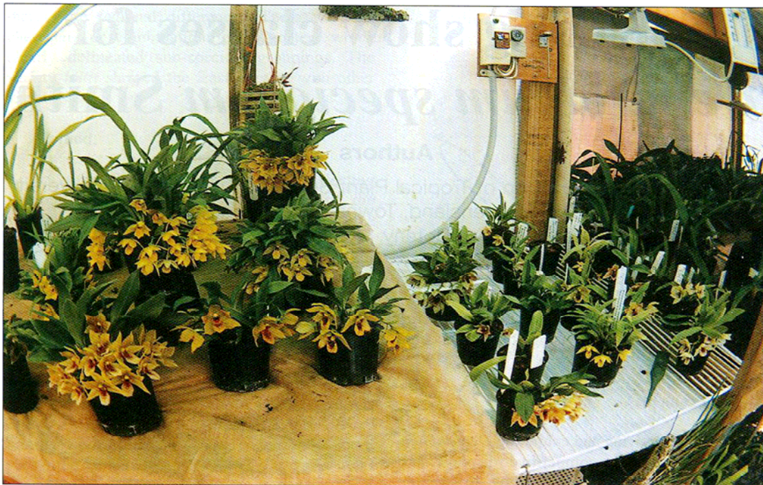
Specimen plants in 74mm and 80mm pots on weed mat over canunda shell on the western side of the orchid house.

Our Sarcophilus house is of timber construction, clad with reinforced polyfilm and old corrugated fibreglass on the roof. The fibreglass has now quite discoloured and has therefore reduced the light level by 25 per cent or more.