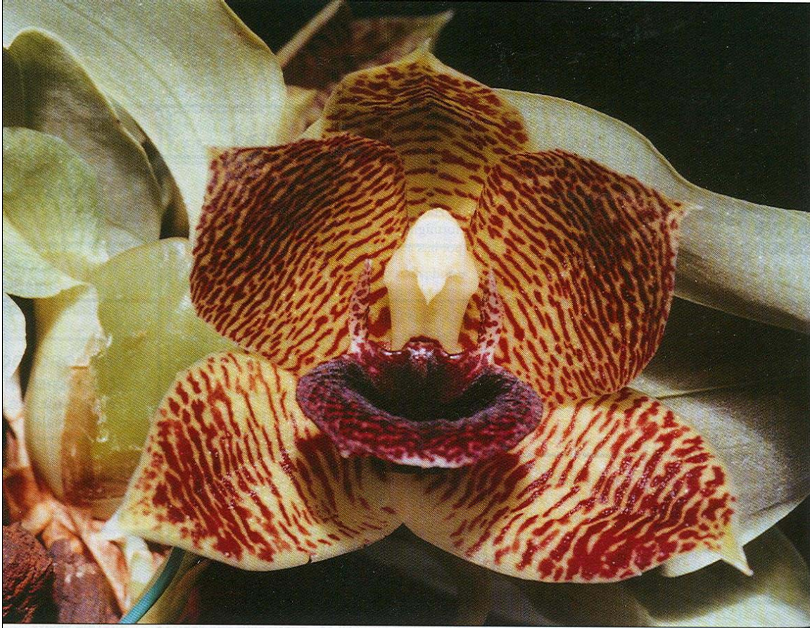
Prom. stapelioides 'Tinonee'.