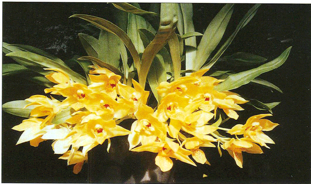
Prom. (Crawshayana x rollissonii 'Carlyle') x Prom. xanthina.

The Promenaeas are on the western side of the house where they get a little more light than the Sarcs. However, during the hottest part of the summer, when the temperatures get up to nearly 30 degrees, a piece of 50 per cent green shade cloth is pulled over the roof to keep the house cool.