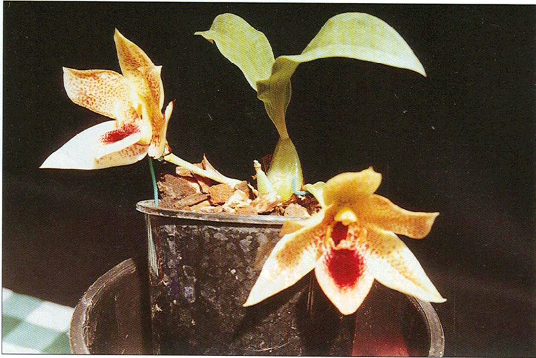
Prom. (Samsu x stapelioides) showing two flowers on a two bulb plant.

There are not many Promenaeas listed in catalogues these days but if you grow Sarcs and have a little room keep looking and you will find some.