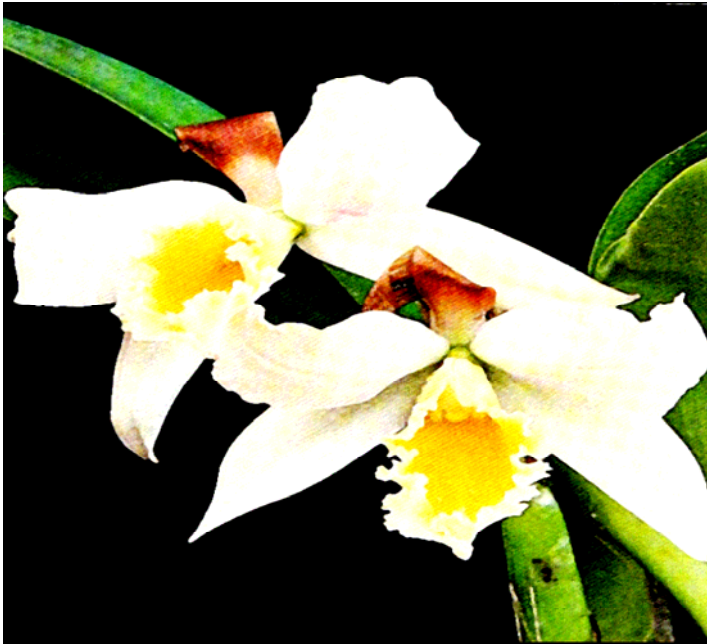
Sepal wilt on a Cattleya hybrid.

Though a less evident factor in orchid culture, the air in a growing area is nevertheless vital and highly influential. From the surrounding air, plants take in carbon dioxide, a necessary ingredient for photosynthesis. Oxygen, on the other hand, is needed for respiration. Potted orchid roots, for instance, require oxygen derived from the air pockets or well-aerated water present in a porous medium, because the uptake of water and nutrients (in addition to root maintenance and growth) is a process which demands energy. Since oxygen and carbon dioxide levels in the air we breathe are adequate for plants as well as animals, the orchid hobbyist need only consider whether the air in the growing area is free of toxic gases, circulating properly, and adequately moist.