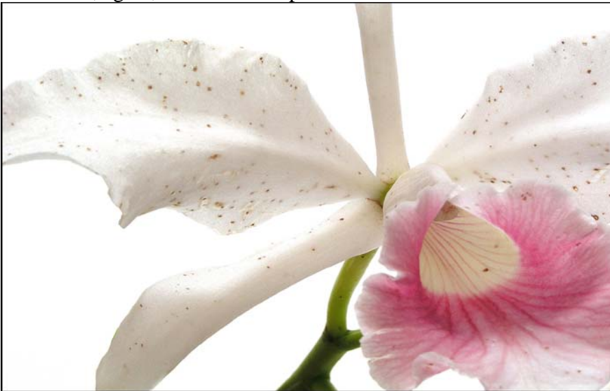
Insufficient air movement and high humidity can foster Botrytis flower blight.

Circulating air must have some humidity, or a sunny and warm growing area may more closely duplicate desert conditions than those of a classic tropical forest! Moisture in the air, along with air movement and temperature, has a substantial influence on the transpiration rate of a plant. Low levels of humidity, especially in combination with high temperatures, can cause orchids to lose water through their leaves at a faster rate than they are able to take up water through their roots, leading to varying degrees of desiccation and wilting. Levels of humidity which are too high for the health of orchids are not likely to be faced by growers without greenhouses, but an atmosphere near saturation (100% relative humidity), and stagnant, can lead to water forming on the leaves and flowers, as well as to the very slow drying of potting media. These are conditions, again, which make a plant and its flowers vulnerable to disease attack.