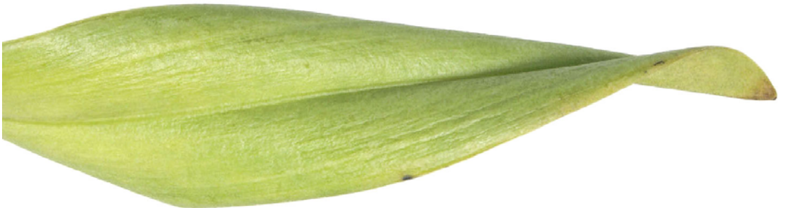
Shriveling of a normally smooth and succulent leaf of a Cattleya hybrid resulted when a Cattleya hybrid was subjected to low humidity and high light.

Porous gravel generates reasonable amounts of humidity in this way by imbibing water, thereby exposing it to more air. Orchids themselves, especially in large numbers and in freshly watered media, do at least partially contribute to the overall humidity in a similar way. Some humidifiers generate humidity by "atomizing" water into smaller amounts, creating a fine mist far more subject to air and far more likely to become a part of it. Other types of humidifiers expose small droplets of water to large volumes of air by blowing air through a fibrous pad moistened in traveling through a tray of water, conveyor-belt fashion.