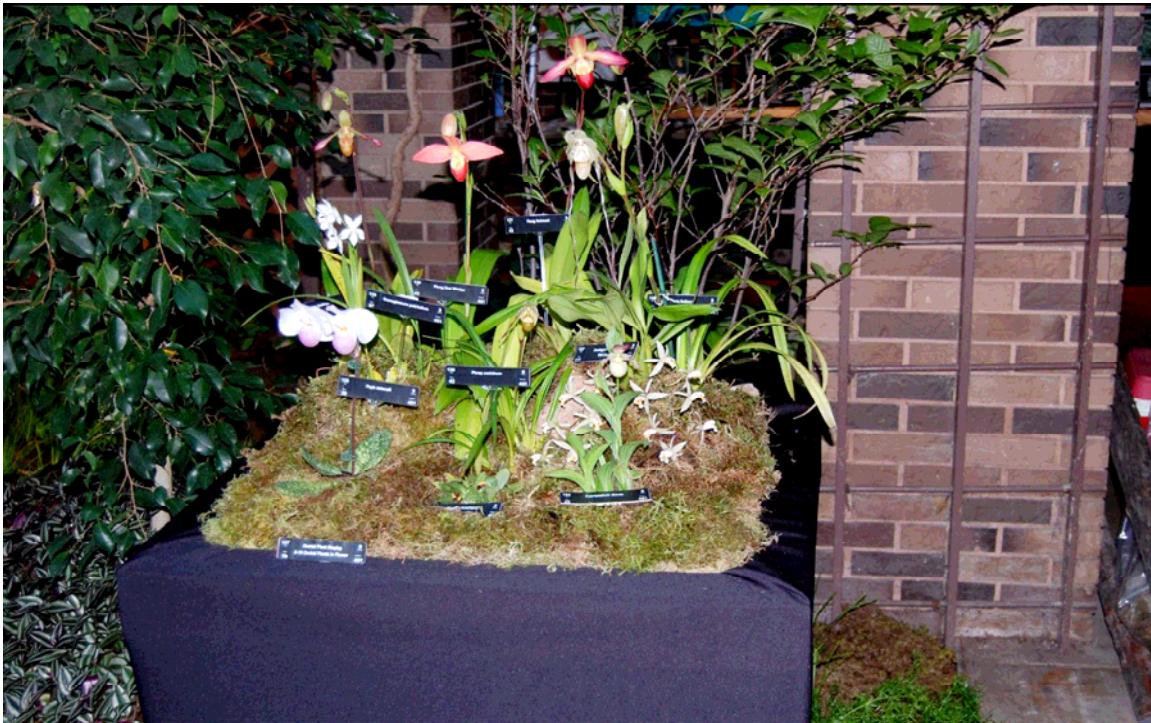
Kevin Duerksen's 1st Place entry—"Orchid Plant Display 6-10 Orchid Plants in Flower" class.