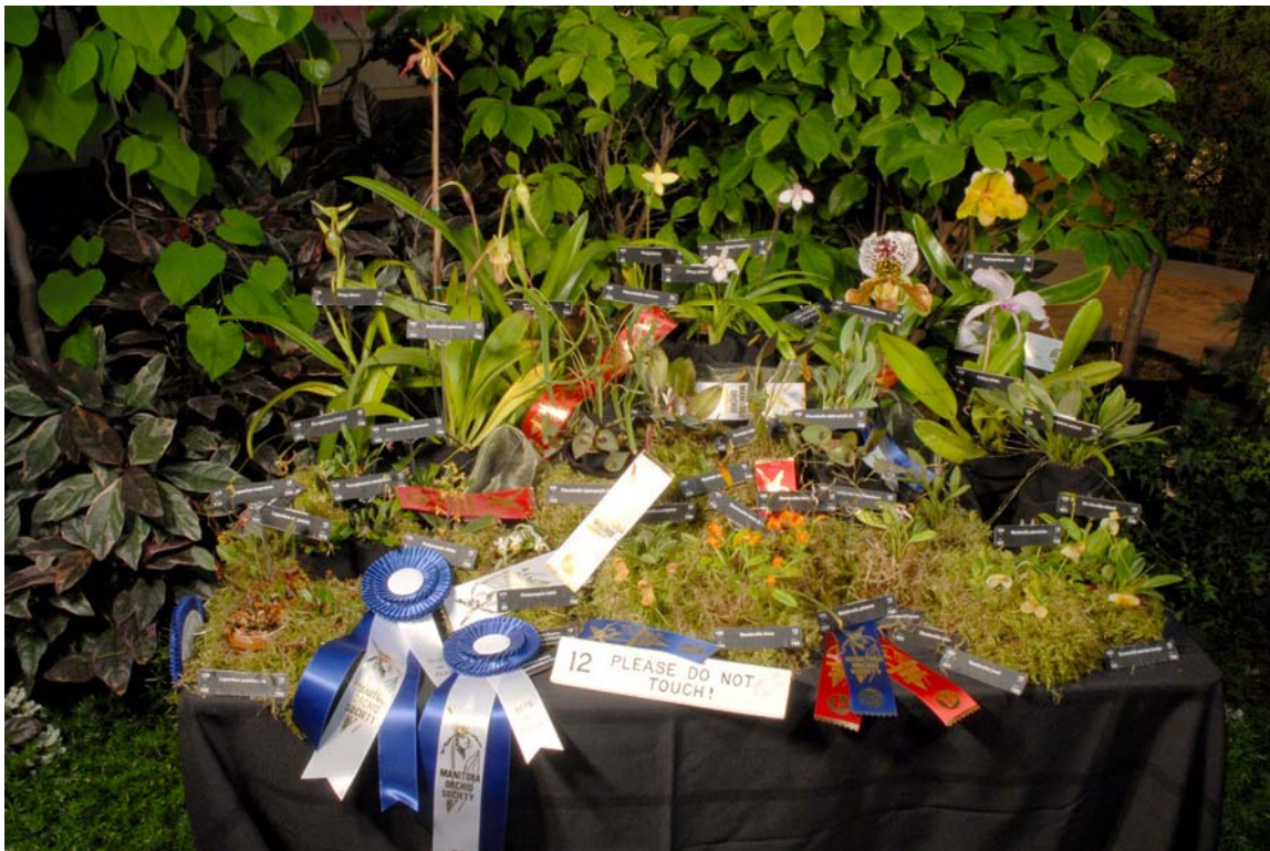
Kyle Lucyk's Double 1 st Place entry—"Orchid Plant Display 26 or more Orchids in Flower" & "Novice Orchid Plant Display 11 or more Orchids in Flower"