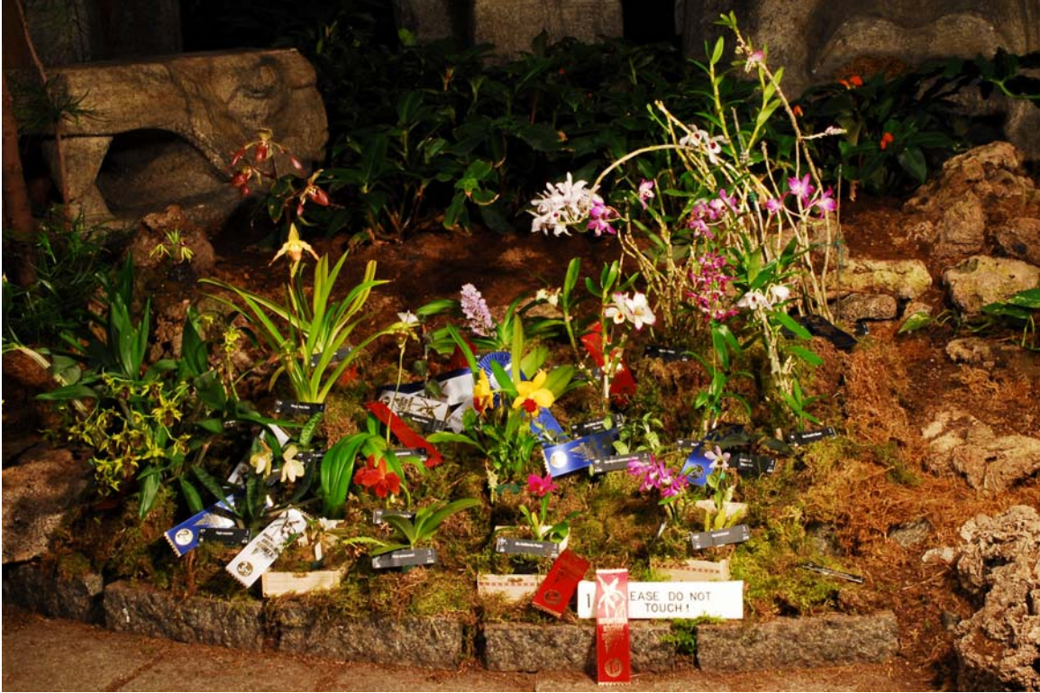
Joyce Jaworski's 1 st Place entry—"Orchid Plant Display 16-25 Plants in Flower"