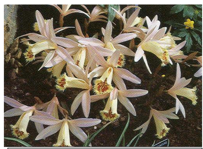
Pleione Shantung cv. cult. Kew

In the fall as soon as all the leaves have dropped remove all the pseudobulbs from the media, cut the old now dead roots off at about 1 cm [1/2 inch] and clean off all of the bracts carefully [don't break off the new growth buds]. Now place each species or clone to a brown paper bag. Remember to